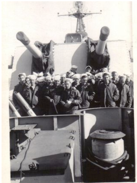
"O" Division on Fantail