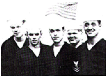
OI Division Radarman 1960's