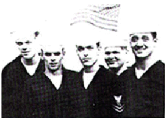
Ol Division Radarman 1960's