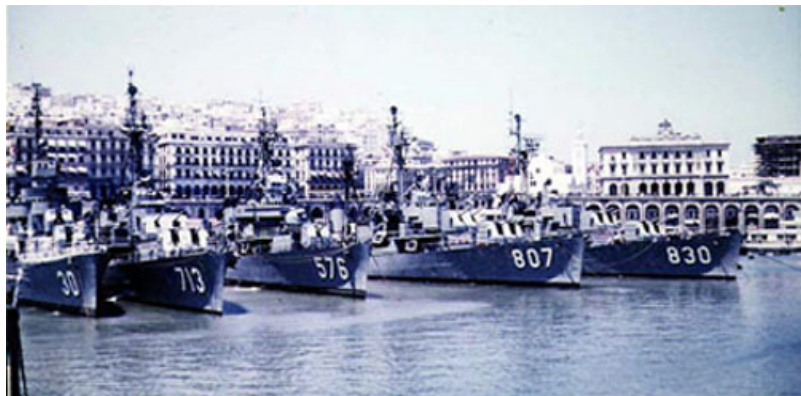
Algiers Early 1950's, Gherardi DMS-30, Kenneth D. Baily DD-713 Maury DD-576, Benner DDR-807, E.F. Larson DDR-830